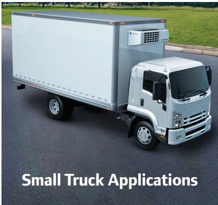
Small Truck Applications